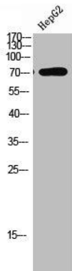
Western Blot analysis of HEPG2 using LIMK-1/2 Polyclonal Antibody.